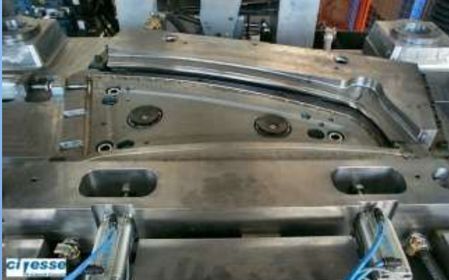
Sealing back windscreen Ci-ESSE mould