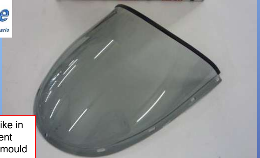
Front Mirror Motorbike in plastic PC transparent made by Ci-ESSE mould