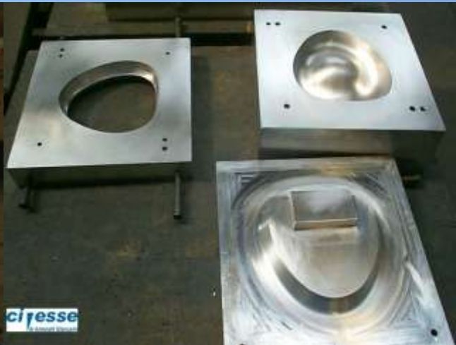
Polyurethane Head rest Ci-ESSE mould