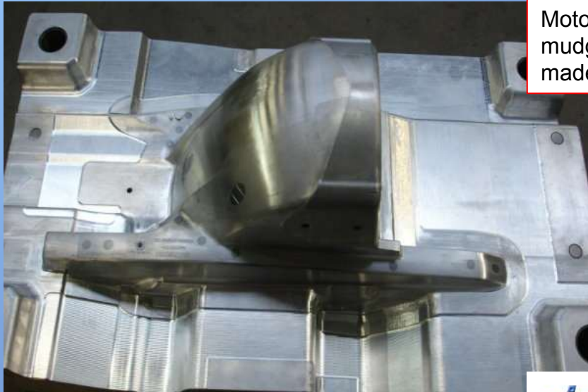
Motorbike main mudguard in plastic made by Ci-ESSE mould