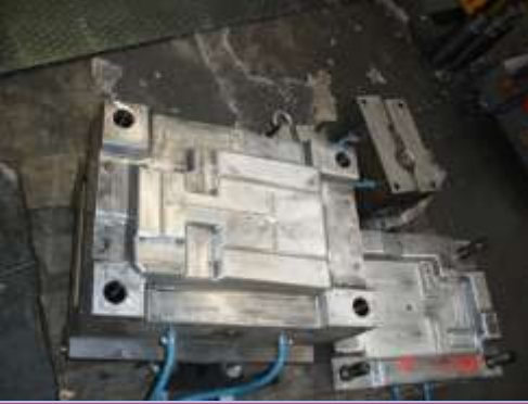
Bumper interior reinforcements In plastic realized by Ci-ESSE moulds