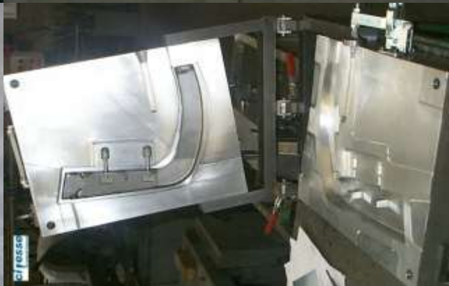
Polyurethane Arm rest Ci-ESSE mould