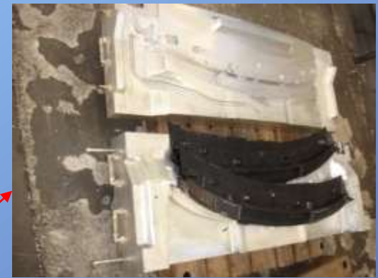
Rear Wind Spoiler In 3 Polyurethane parts realized by Ci-ESSE moulds