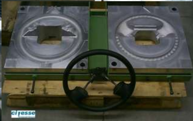
Polyurethane Steering wheel Ci-ESSE mould