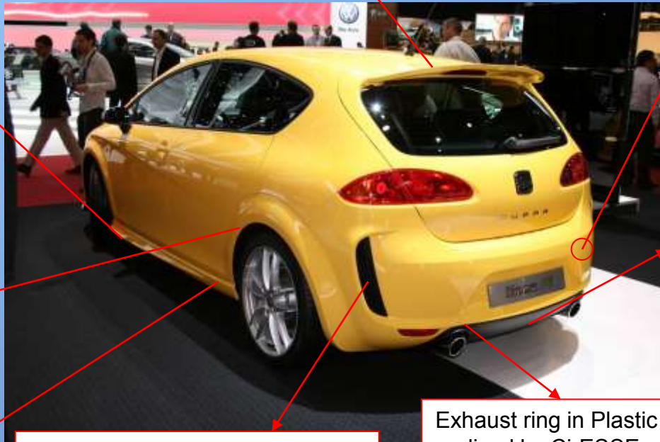
Air Grill in Plastic realized by Ci-ESSE moulds