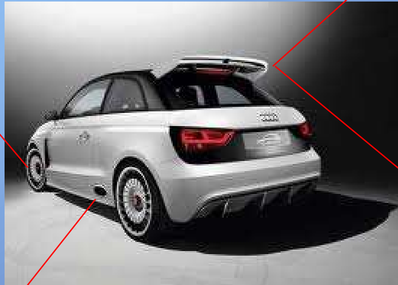
Side Skirts in Polyurethane realized by Ci-ESSE molds