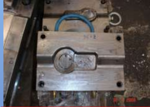
Cap towing bumper in Plastic realized by Ci-ESSE moulds