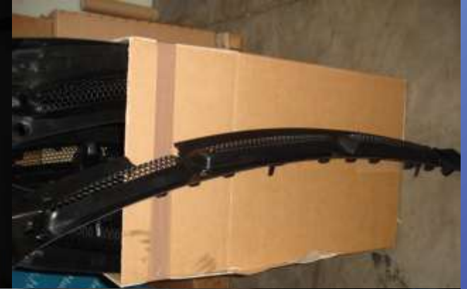
Plate holder in plastic realized by Ci-ESSE moulds AUDI A1, A3, A4 , A6