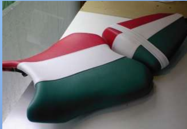
Motorbike Back seat PU+ Vacuum forming PVC made by Ci-ESSE resin mould