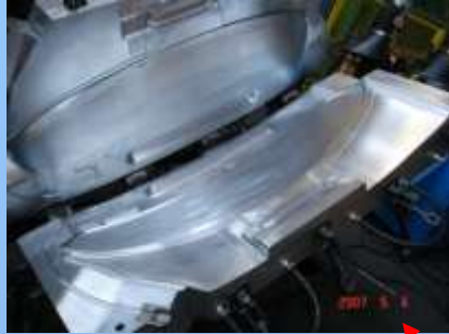
Roof Spoiler in PU realized by Ci-ESSE moulds