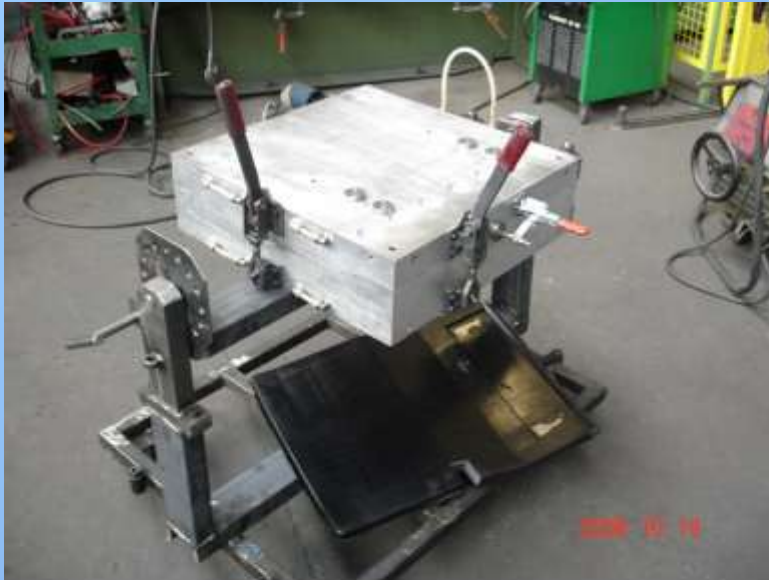
Class seat & back in PU for Tractor Cabin with moulds made by Ci-ESSE