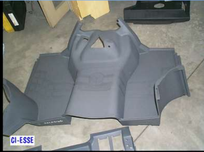
NEW HOLLAND UTILITY PU Insulation carpet with moulds made by Ci-ESSE