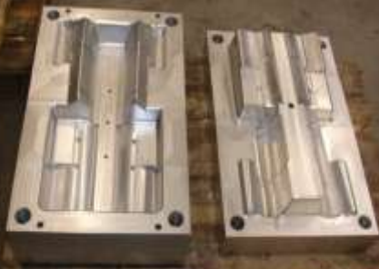
Front / Rear Caps Side skirts in Plastic realized by Ci-ESSE moulds