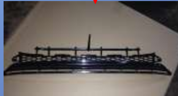
Front Lower middle Grill in plastic realized by Ci-ESSE moulds