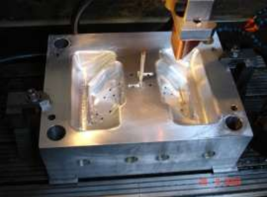
Light cleaner in Plastic realized by Ci-ESSE moulds