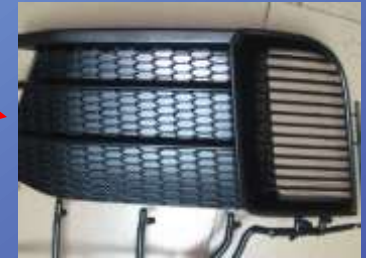
Front Rh Grill in plastic realized by Ci-ESSE moulds