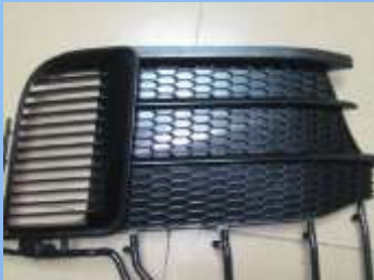
Front Lh Grill in plastic realized by Ci-ESSE moulds