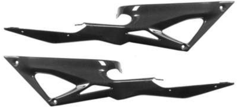
Lateral Motorbike covers in plastic made by Ci-ESSE mould