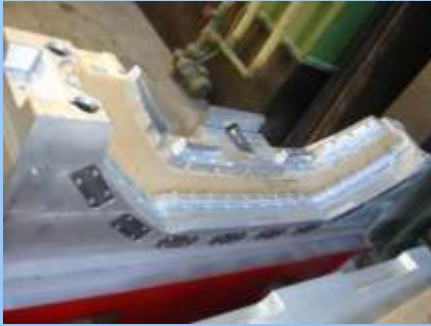
Front Spoiler in Polyurethane realized by Ci-ESSE molds