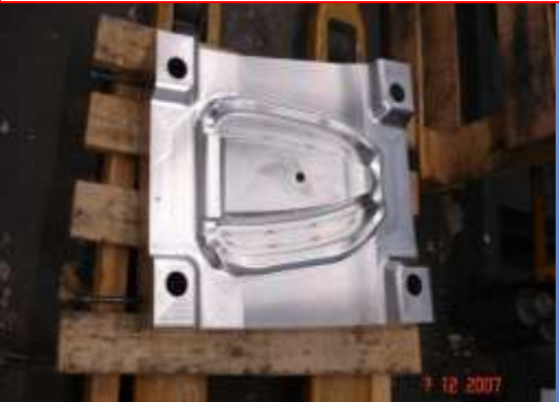
Air Grill in Plastic realized by Ci-ESSE moulds