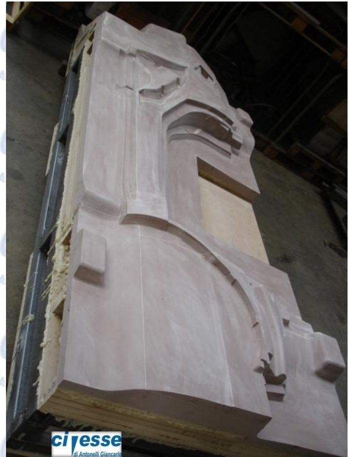
Proto-tools ureol + resin + alu inserts for p-DCPD tech