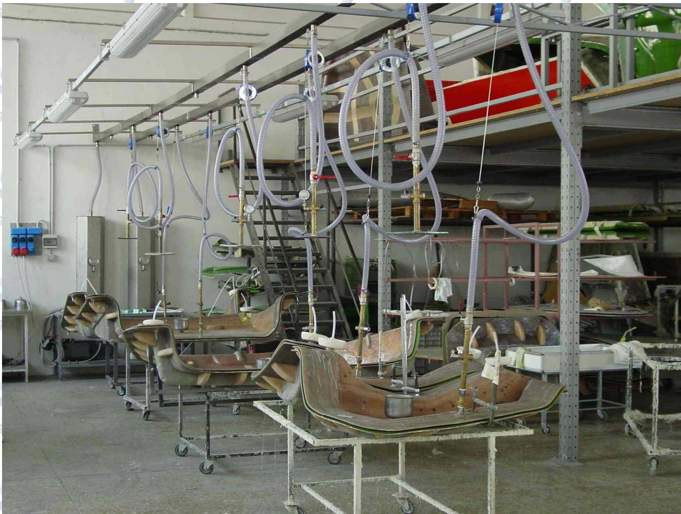
Production in RTM light By Ci-ESSE epoxide resin molds