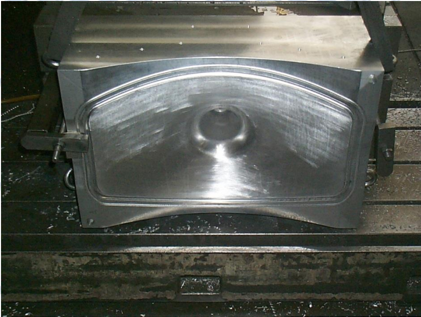
Puff for seat chair in RTM light By Ci-Esse aluminium molds