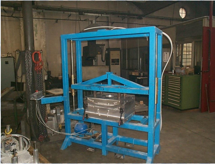
Self pneumatic mold carrier for Puff for seat chair in RTM light By Ci-ESSE aluminium molds