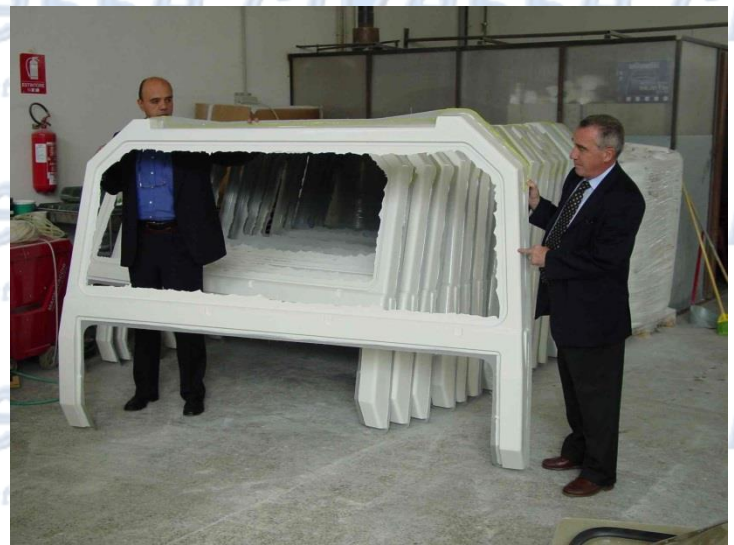
Large roof spoiler and structure in RTM light By Ci-ESSE epoxide resin molds