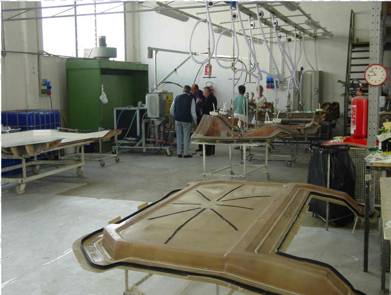
Large roof in RTM light By Ci-ESSE epoxide resin molds