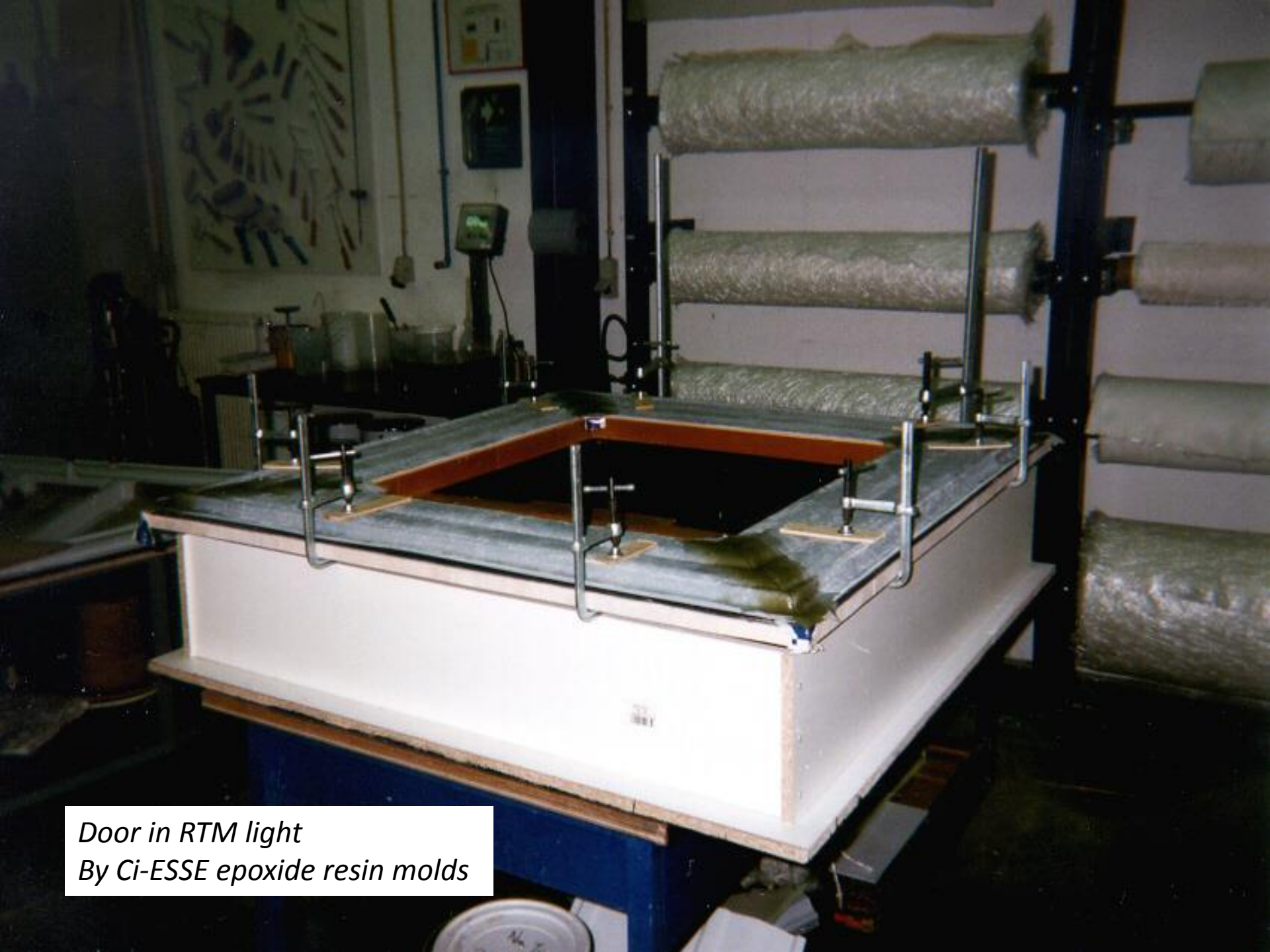
Door in RTM light By Ci-ESSE epoxide resin molds