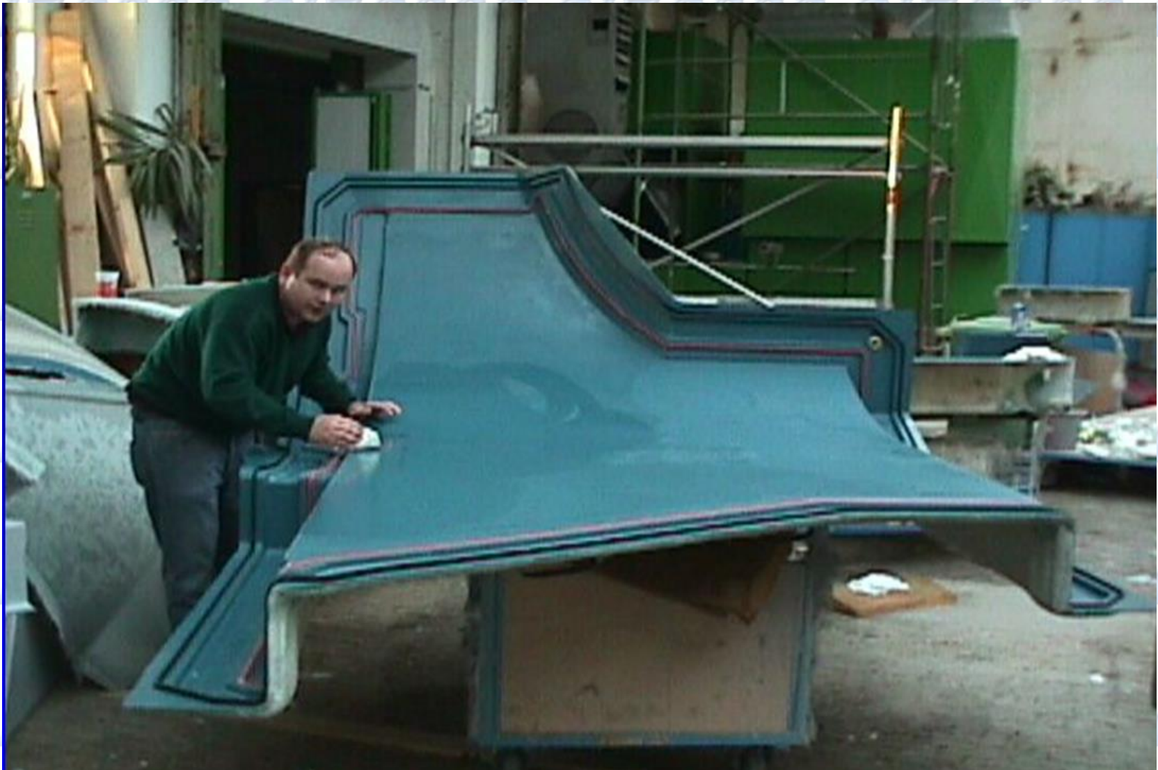
Large cover in RTM light By Ci-ESSES epoxide resin molds