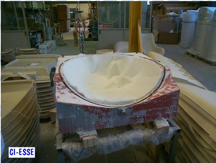
Cover chair production site RTM light By Ci-ESSE aluminium molds